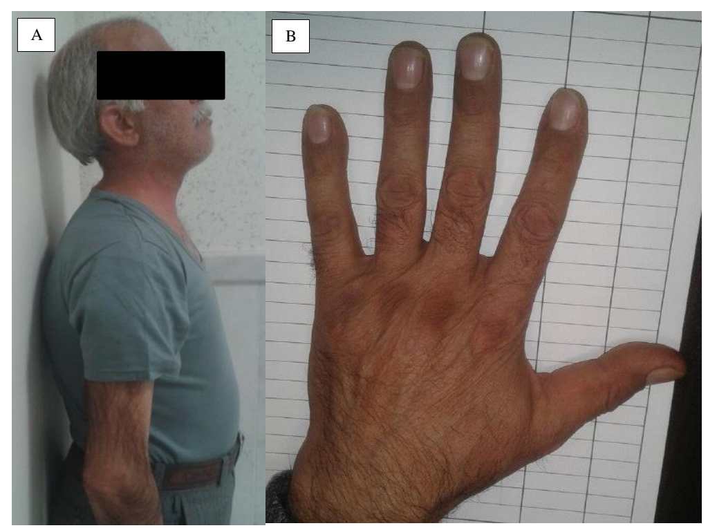
Fig. 1. A) Lateral image of the patients, showing severe dorsal kyphosis in addition to lumbar and cervical lordosis. B) A typical "doughnut sign" is evident over the proximal interphalanges joints, in which the skin rim is elevated and the central part is depressed.

Upon musculoskeletal examination, dorsal kyphosis and increased lumbar and cervical lordosis was found (Fig. 1A). The Schober's test result was 3 cm with a mean tragus-to-wall of 18 cm, a mean neck rotation of 35 degrees, maximal intermalleolar distance of 115 cm, and a mean lateral flexion of 13 cm with a Bath Ankylosing Spondylitis Metrologic Index (BASMI) of 5. The shoulders and hips were limited in all directions, which seemed to be related to the patient's severe skin stiffness. Other examinations were unremarkable.