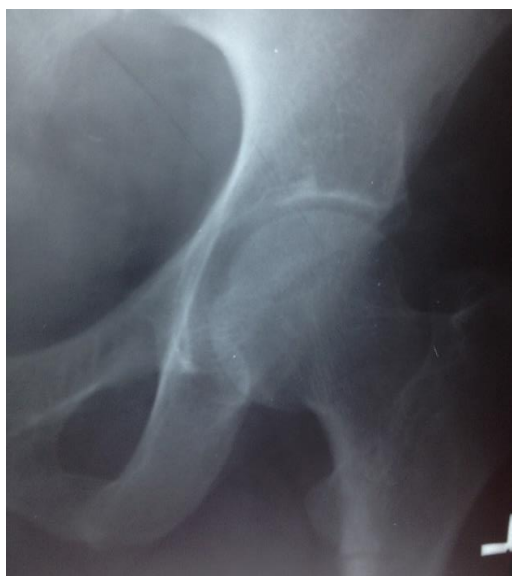
Fig.1. A looser zone in the left thigh bone